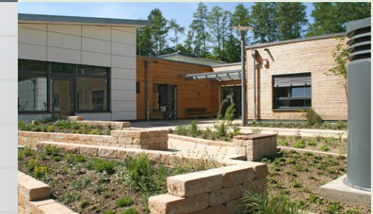
Kirchendelle integrative child day – care and family centre

There are wide- ranging options for schooling and further education: