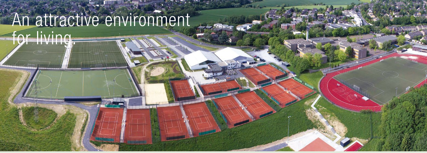
Sports centre with Football & Hockey pitches, Tennis courts, and Track & Field facility